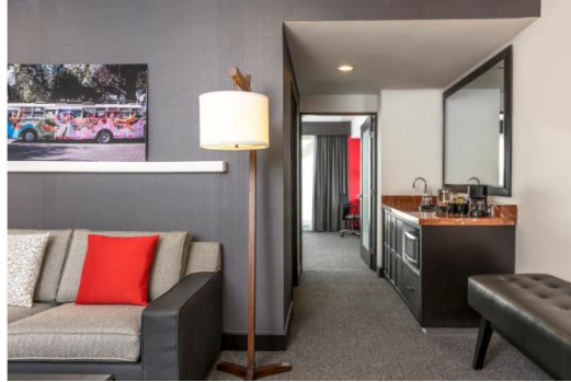
Suites Living Room